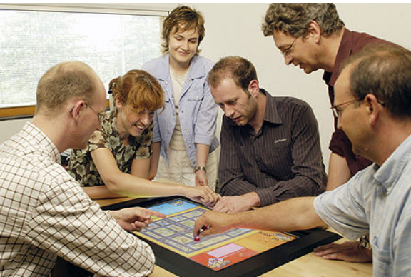
Figure 2: Philips Entertaible

Recent technological advances in user input tracking have enabled the construction of interactive tables that can now be commercialized. They enable the detection and tracking of multiple points of input, including complex shapes such as hand profiles, from multiple users simultaneously.