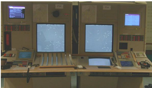
Figure 1: ODS control position

This control position is clearly designed for two controllers with specific activities and roles. The tactic controller (on the left), is in charge of contacting aircrafts, attributing clearances, managing guidance and separations, resolving conflicts and transferring aircrafts to other sectors. His/her main tools are the paper strip board, the radar display and the radio. The planner controller (on the right) is in charge of inter-sector coordinations, integration of new strips and pre-analysis to help the tactic controller. His/her tools are the strip board, the telephone and the radar display.