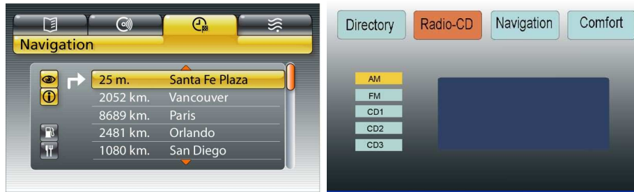
Fig. 2. a. With one graphics file